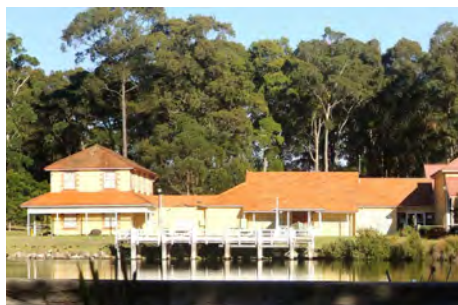
Jervis Bay Maritime Museum, Huskisson, NSW