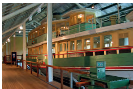
Lady Denman ferry