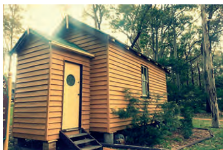
Historic bush church